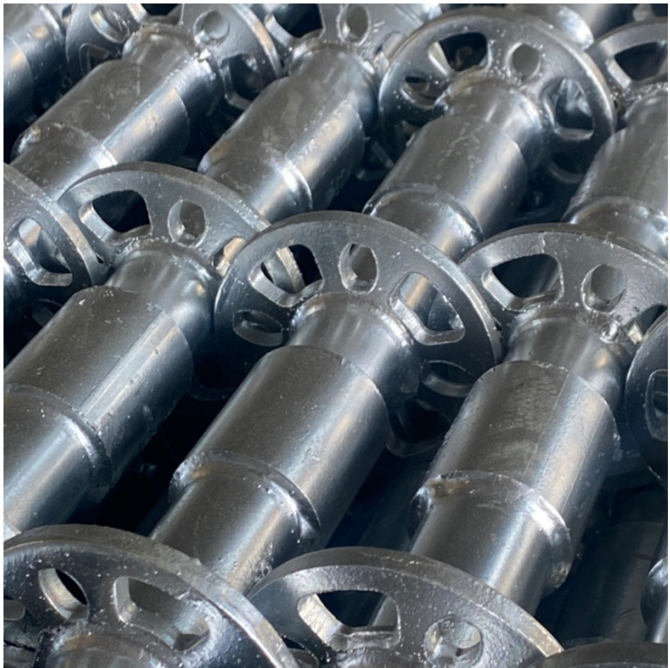
Warehouse & Loading